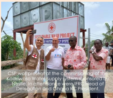
CSP was present at the commissioning of the Kadewaso Water Supply system sponsored by Nestle. In attendance were IFRC Head of Delegation and Ghana RC President.