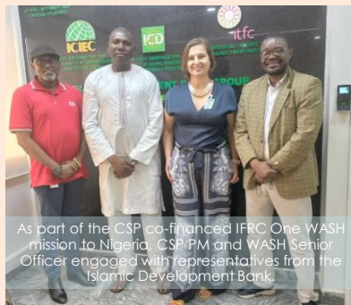
As part of the CSP co-financed IFRC One WASH mission to Nigeria, CSP PM and WASH Senior Officer engaged with representatives from the Islamic Development Bank.