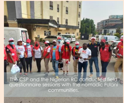
The CSP and the Nigerian RC conducted field questionnaire sessions with the nomadic Fulani communities.