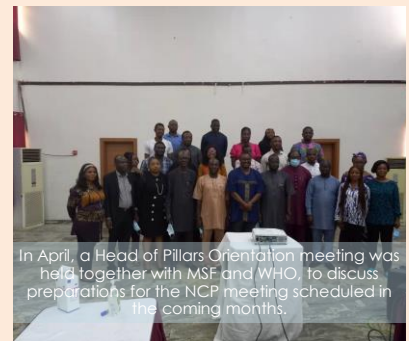
In April, a Head of Pillars Orientation meeting was held together with MSF and WHO, to discuss preparations for the NCP meeting scheduled in the coming months.