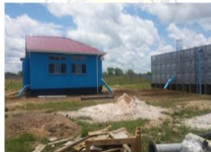
Reservoir and Booster Station