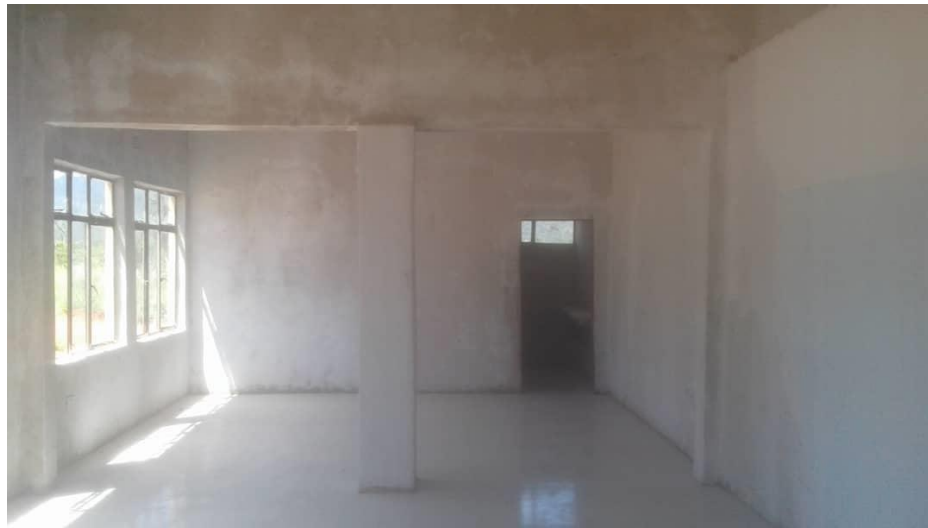
Rehabilitation of isolation facility (CTC) in Mpulungu (one of the hotspots)