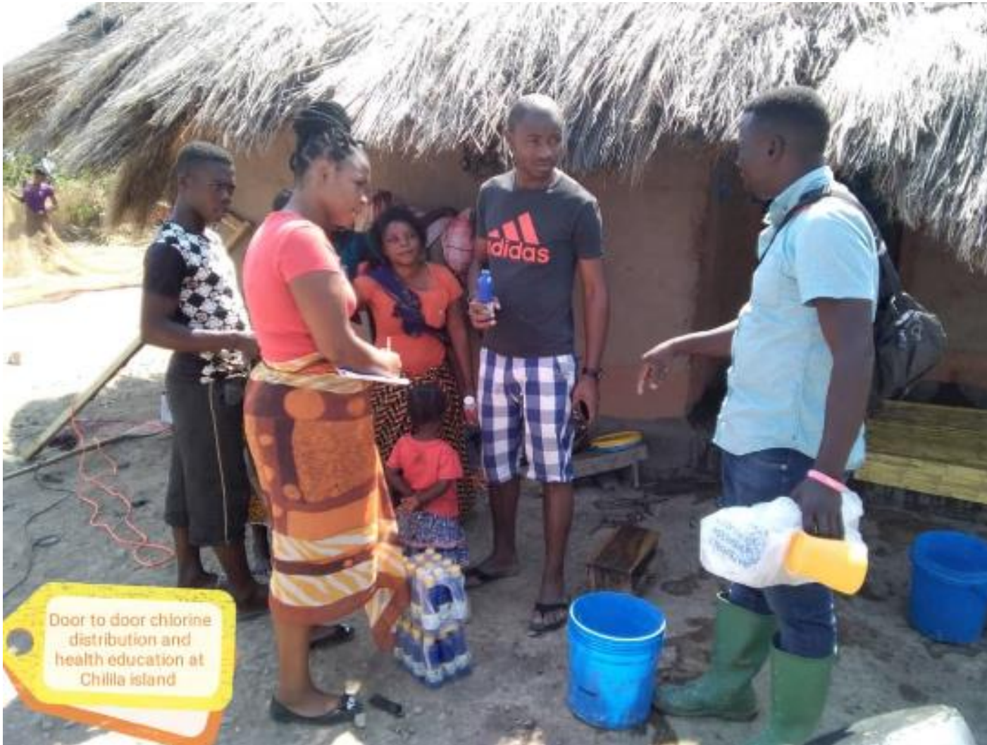
Door to door chlorine distribution and health education at Chilila island

National community Engagement plan developed; Community engagement & sensitizations on-going